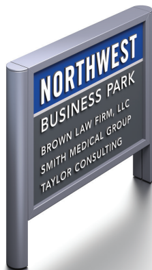
RADIUS POST & PANEL