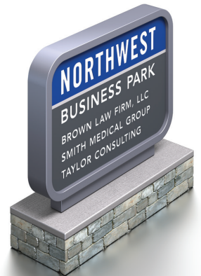
RADIUS CORNER FRAME / BASE MOUNT ON STONE