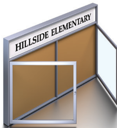
2-DOOR INDOOR ENCLOSED CORKBOARD WITH HEADER