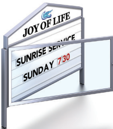
CATHEDRAL OUTDOOR READERBOARD