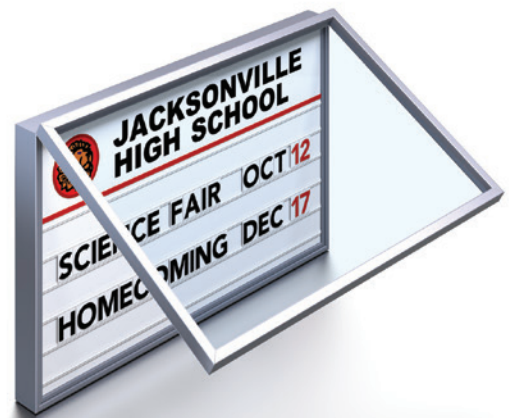
SINGLE FACE ILLUMINATED OUTDOOR READERBOARD