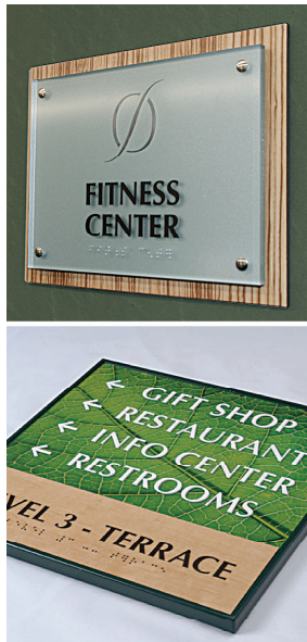
STANDARD ADA SIGNAGE