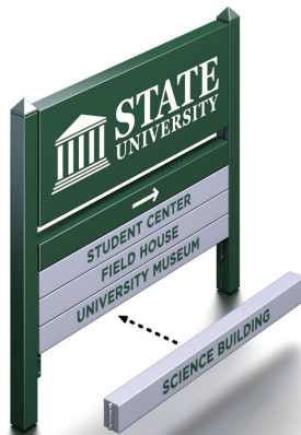
HEADER / SQUARE 325 POSTS / FINIALS / WORD BARS