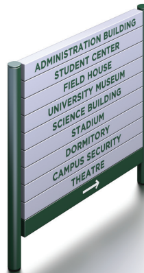
225 EXTENDED RADIUS POSTS / WORD BARS