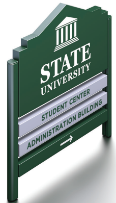
CUSTOM SHAPED HEADER / EXTENDED 325 RADIUS POSTS / WORD BARS