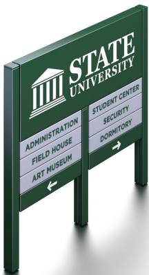
HEADER / TRIPLE 325 POSTS / WORD BARS