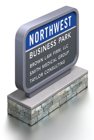
RADIUS CORNER FRAME / BASE MOUNT ON STONE