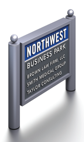
FULL ROUND POST & PANEL / FINIALS