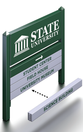
HEADER / SQUARE 325 POSTS / FINIALS / WORD BARS