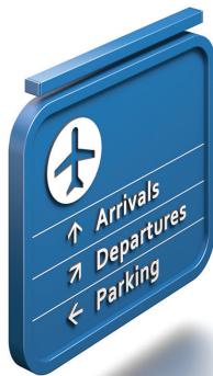
CEILING MOUNT w/RADIUS CORNERS