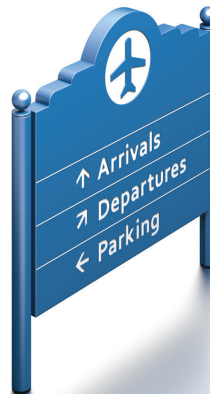
FULL ROUND POST & PANEL / FINIALS / CUSTOM TOP